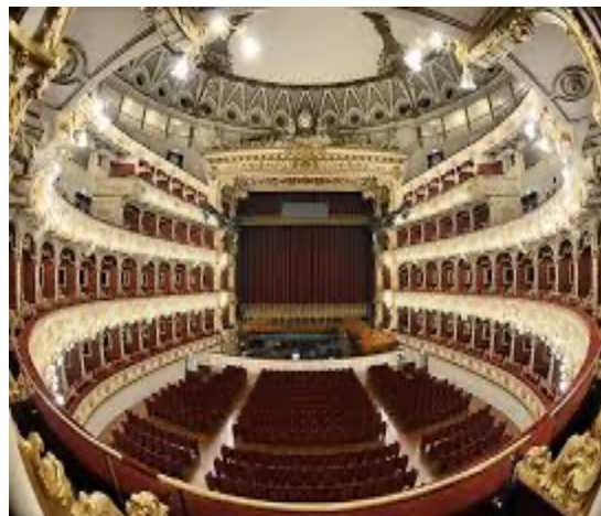
Teatro Petruzzelli, Bari

PLEASE BOOK EARLY TO ENSURE AVAILABILITY OF THESE TICKETS.